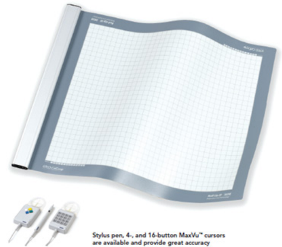
Stylus pen, 4-, and 16-button MaxVu™ cursors are available and provide great accuracy

Portable, light weight Roll-Up III digitizers are only 0.078 in / 2.0 mm thick allowing them to be easily rolled for storage or transport to various task sites. Constructed with advanced materials, including a tough Lexan® work surface, Roll-Up III digitizers lay flat, maintain a smooth work surface and feature flexible dual orientation that allows the controller housing to be configured on the right or left edge of the digitizer.