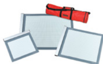
Roll-Up III digitizers come in various sizes with an optional travel case